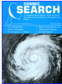
Cosmic Search: Issue 8 (Volume 2 Number 4; Year End 1980) [Miscellaneous items found throughout the magazine]